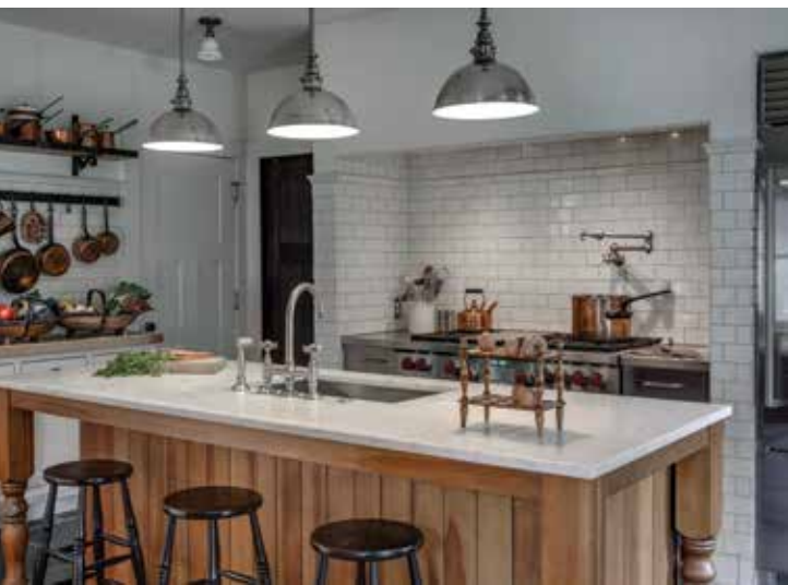
DINNER IS SERVED Above: To obtain an across-the-pond look and to update the kitchen, the men opted to remove an avocado-green oven and other 1970s souvenirs. Today, a large, marble-topped island is a highlight.