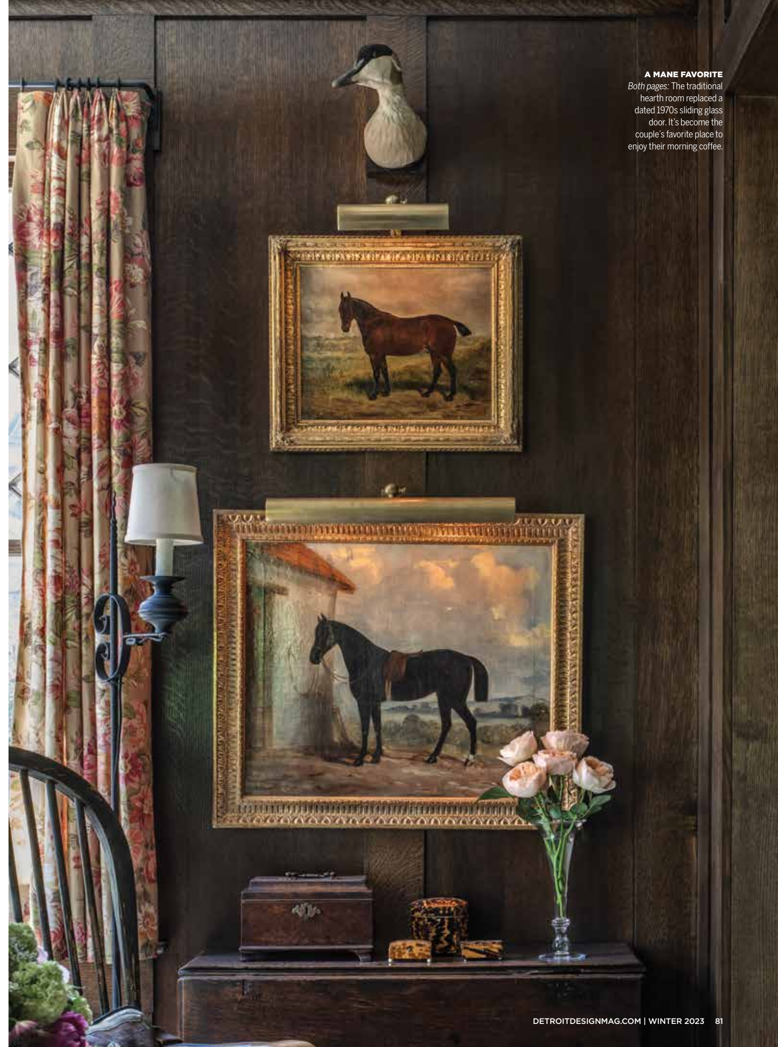
A MANE FAVORITE Both pages: The traditional hearth room replaced a dated 1970s sliding glass door. It's become the couple's favorite place to enjoy their morning coffee.

TEXT BY KHRISTI ZIMMETH | PHOTOGRAPHY BY JUSTIN MACONOCHE